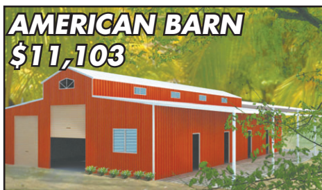
AMERICAN BARN $11,103

9m x 30m x 4m, 3 Open Front Bays Colour Walls Zinc Roof $21,467 All Zinc $20,773