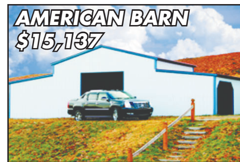
AMERICAN BARN $15,137

BARN plus open Lean To one side 2x Roller Doors, Zinc Roof included 10.5m x 14m x 3.6m + 3.5m Open LT $14,160 10.5m x 10.5m x 3.6m + 3.5m Open LT $11,103