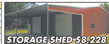
STORAGE SHED $8,228