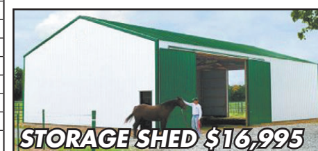
STORAGE SHED $16,995

8m x 20m x 4m, 2 Sliding Doors Colour Walls Zinc Roof $16,995