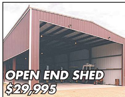
OPEN END SHED $29,995

7.5m x 12m x 4m, 1 x Roller Door Colour Walls Zinc Roof $9,776