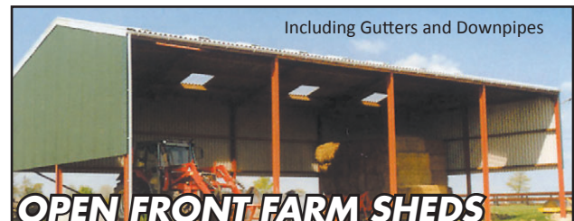
OPEN FRONT FARM SHEDS

12m x 30m x 6m Colour Walls Zinc Roof $29,995