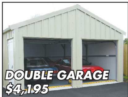
DOUBLE GARAGE $4,195

More information at www.shedmakers.com.au