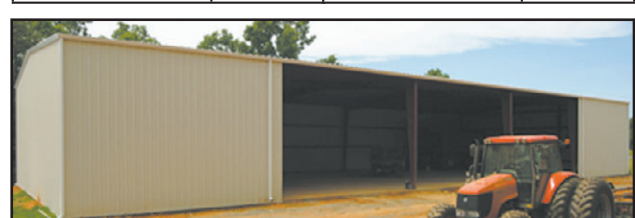
MACHINERY SHED $20,773

8m x 20m x 4m, 2 Sliding Doors Colour Walls Zinc Roof $16,995