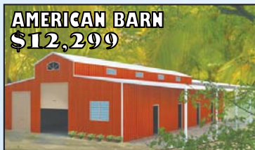
AMERICAN BARN $12,299

9m x 30m x 4m, 3 Open Front Bays All Zinc $22,229