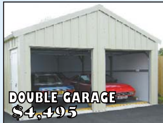
DOUBLE GARAGE $4,495

“ULTRAFRAME” ® is made from Rectangular Hollow Section (RHS) structural steel or universal beam and web truss for larger spans. All brackets, cleats and joiners are welded to the “ULTRAFRAME” ® . This gives you a much stronger shed and will halve the time spent erecting your shed. More information at www.shedmakers.com.au