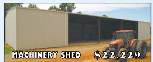
MACHINERY SHED $22,229

8m x 20m x 4m, 2 Sliding Doors Colour Walls Zinc Roof $18,299