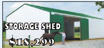
STORAGE SHED $18,299

8m x 20m x 4m, 2 Sliding Doors Colour Walls Zinc Roof $18,299