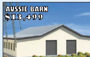
AUSSIE BARN $13,499

HOMESTEAD 7m x 12m + Veranda 4 Sides $74,999 MANSION 7m x 12m + Veranda 2 Sides $61,399 LOOKOUT 7m x 12m + Veranda 1 Sides $53,199