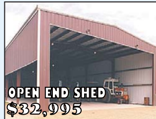
OPEN END SHED $32,995

7.5m x 12m x 4m, 1 x Roller Door Colour Walls Zinc Roof $9,995