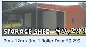
STORAGE SHED $9,299