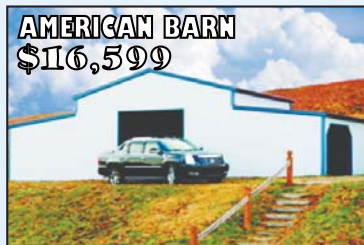
AMERICAN BARN $16,599

BARN plus open Lean To one side 2x Roller Doors, Zinc Roof included 10.5m x 14m x 3.6m + 3.5m Open LT $15,599 10.5m x 10.5m x 3.6m + 3.5m Open LT $12,299